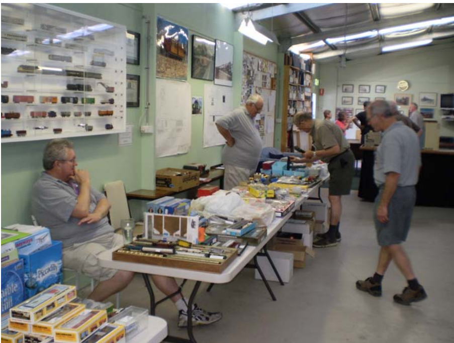
The club table