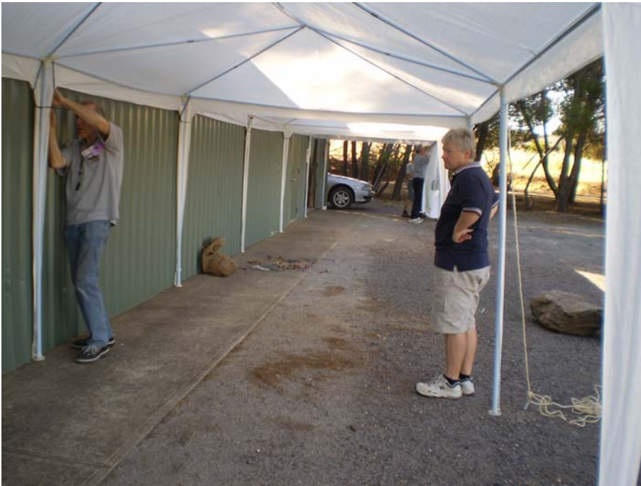
Setting up for the open day