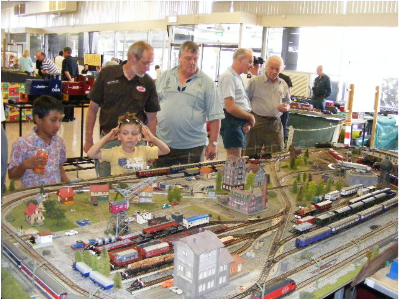
Above: The Märklin club presented this layout "Ralph" and a smaller one called Wintersdorf

There are lots of photos in our Member's Gallery http://noarail.com/members2/main.php most are not named or sorted but they will soon be and then go to our main gallery.