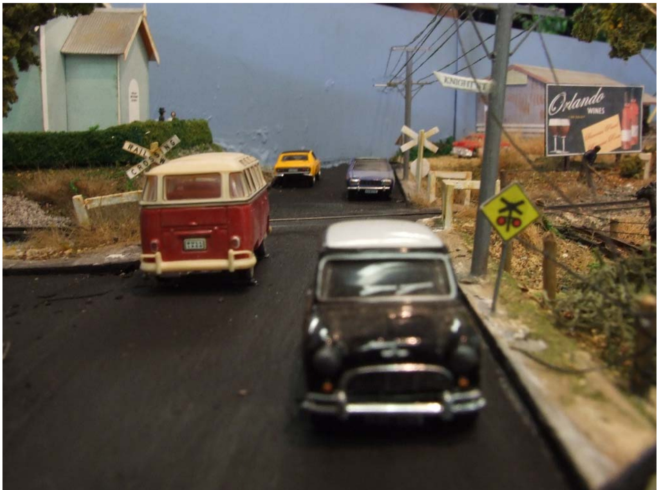
Below: A scene from Liralau, winner of the Best Display as voted by peers

Send items for inclusion in this newsletter to the Editor via e-mail at admin@noarail.com This newsletter is available as a download from our website (address above) saving the club postage and printing, most pictures are in colour. Notification is sent by email when it is available for download.