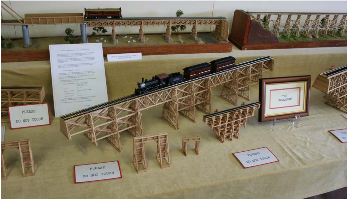
Above