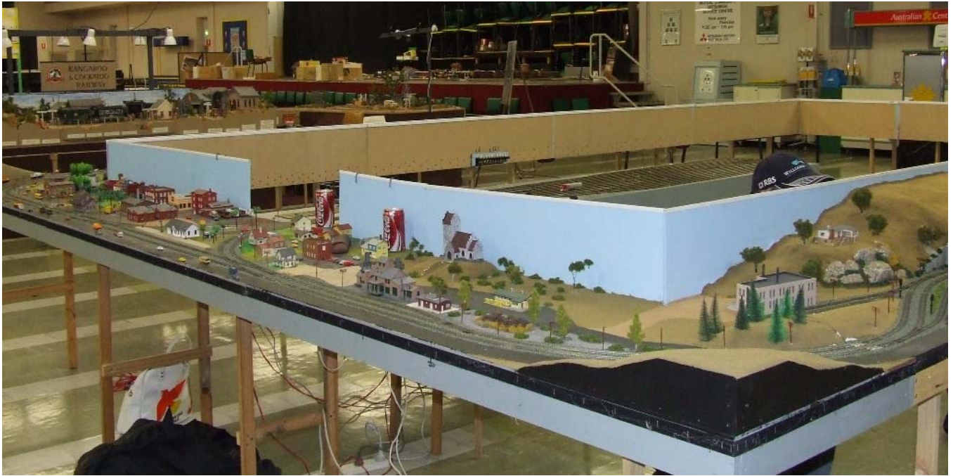
Above: Friday setup, Mollie's Crossing. John, take note of the 12" to the foot Coke cans!

Six of the layouts and one display came from interstate; five of these were new to South Australia. Three of the local layouts were new to the exhibition scene, having only been finished shortly before the weekend. Two of the owners of these new layouts have stated that they are only interested in exhibiting at our exhibition, another feather in our cap. As there were more layouts and displays this time, we used more of the available space but there was still plenty of room to move about, an item noted many times on the overwhelming feedback that we are getting.