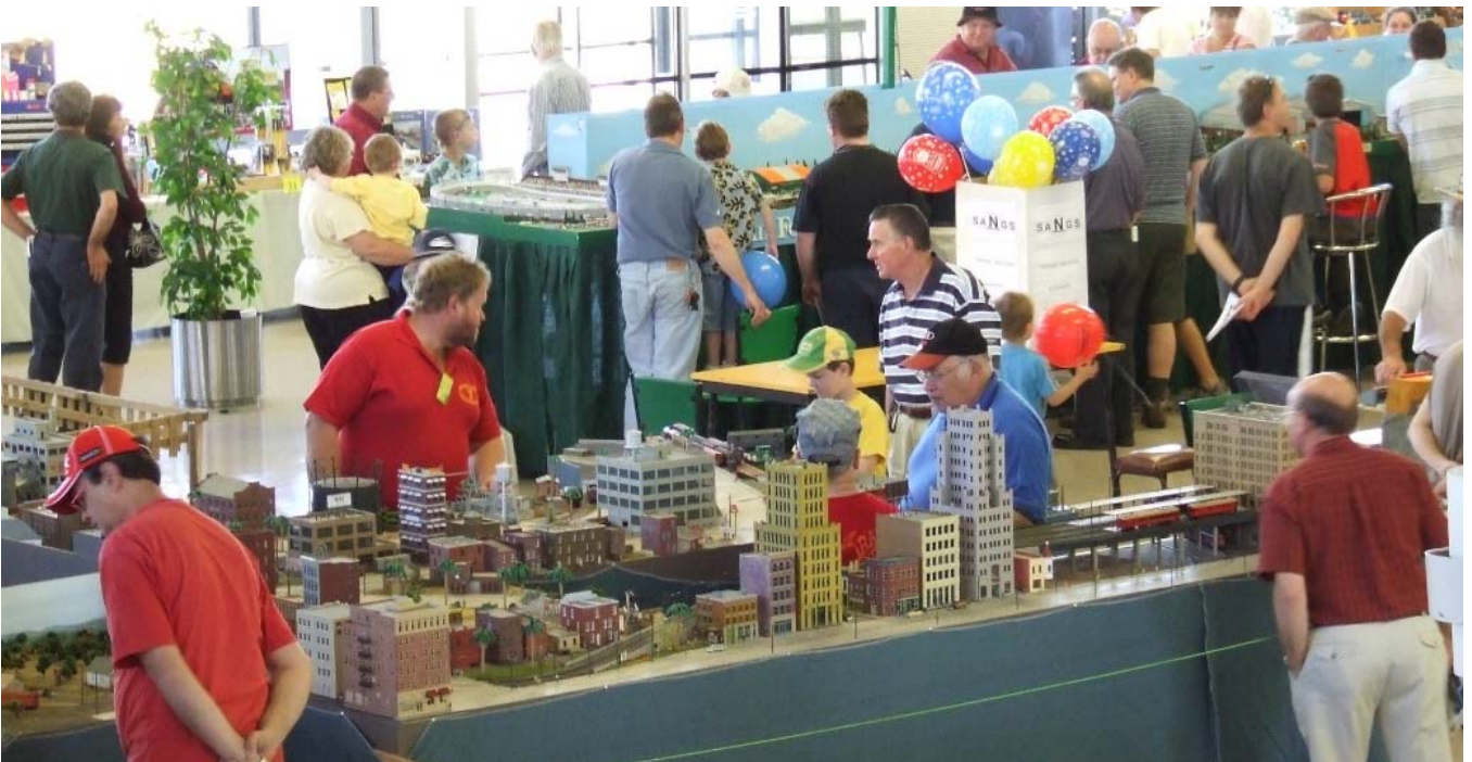
Below: Phoenix Electric with Yesterday's Air force in the background

On the Friday many helpers cleared the tables and chairs from the venue, hung power cables, marked out the floor, filled fridges, put up signs, helped exhibitors and traders carry equipment and setup their displays, setup the BBQ, cooked and sold egg and bacon sandwiches and sausage sizzles.