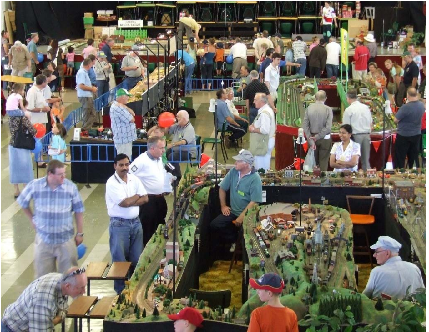
Below: front to back Mid-West Railroad, DECCA, Ready To Run and Graeme's Garden Railway

The entrance prices were kept the same as last time $2 / $5 / $12 (Kids / Adults / Families) Sausage Sizzle and Canteen prices were also unchanged so that everyone could afford to have a good time. With constantly rising prices all around us, this was actually equivalent to a price reduction. The exhibition was promoted on local radio and television stations on their community listings. Several websites, including ours had a listing and on Railpage™ www.railpage.com.au/forums there is a posting 'Exhibition Adelaide' that with a little help from yours truly has now gone to popular status. The venue is permanently listed on Google Earth, as are our clubrooms. Extra roadside signs and an advert in the newspaper were also used to promote the event.