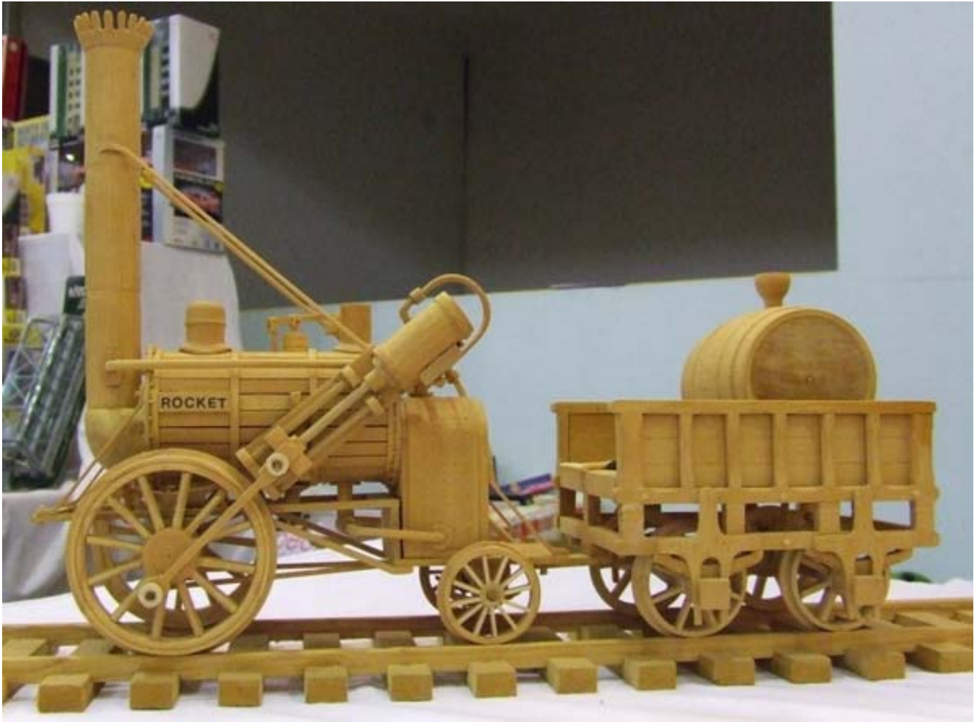
Below: A wooden Rocket